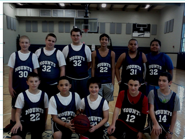
2011-12 Mounts seventh grade boys' basketball team.