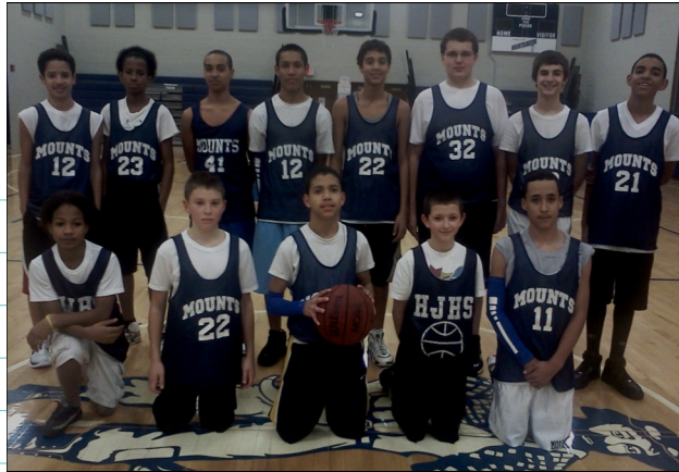
2011-2012 Mounts eighth grade boys' basketball team.